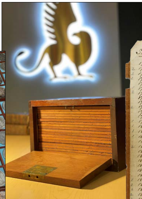
The wooden cabinet Millholland built to house his collection and where the coins were kept untouched until they came to our New York City gallery in 2022.